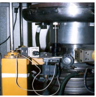
Fig. 4. Control rotation speed system.