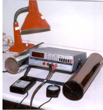
Fig. 8. Photoreceptor resistance measurement upon exposure to light.