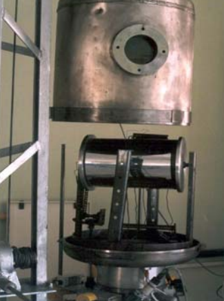
Fig. 6. Al deposition and Al<sub>2</sub>O<sub>3</sub> formation.