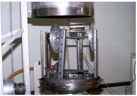
Fig. 3. Substrate rotator and holder system.