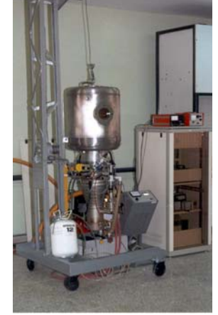
Fig. 5. The coating system and its subsystems.