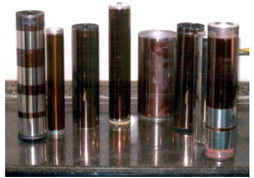
Fig. 7. Se deposition on the Al_2O_3 .