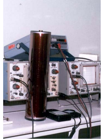
Fig. 9. Photoreceptor resistance measurement in dark.